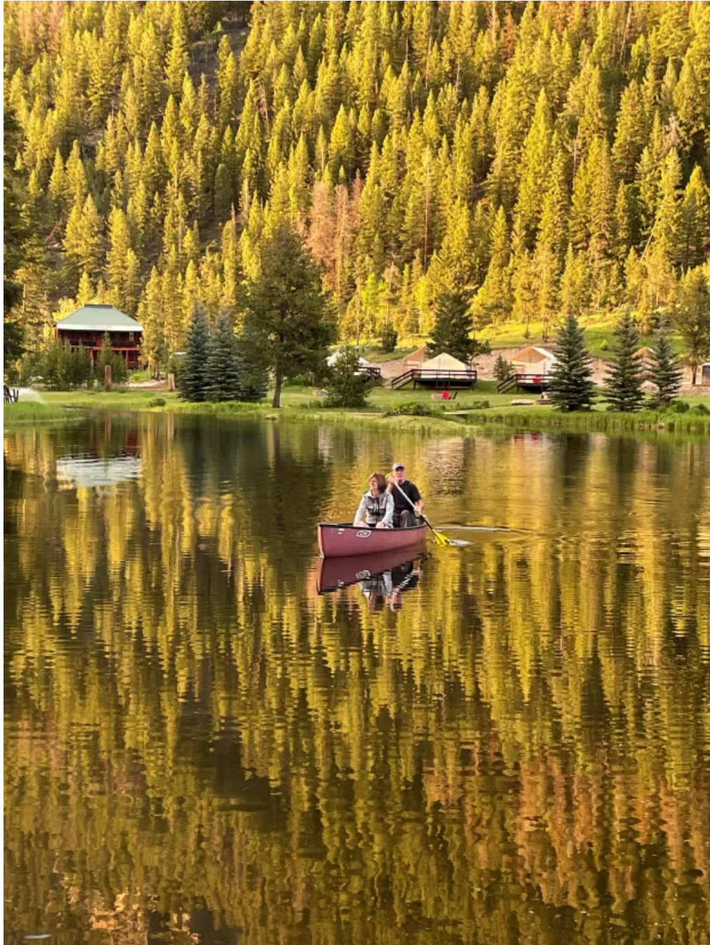
Arapaho Valley Ranch is located near Lake Granby, Colorado.

Perched on the South Fork of the Colorado River, the 40-acre spread showcases some of the original buildings of the era, such as the main lodge, which features the smallest and one of the oldest bars in the state.