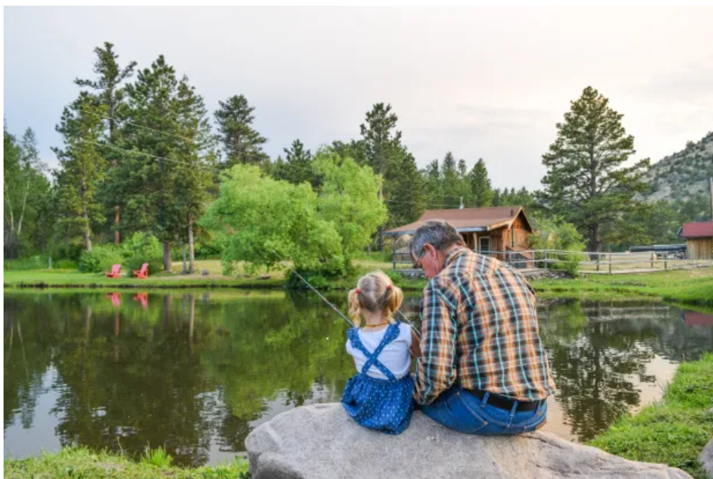
Cherokee Park Ranch in the Rawah Wilderness near Rocky Mountain National Park embodies western charm.

Inside the 120-year-old main log lodge and throughout the log cabins, you'll see an array of western-style furnishings and antiques that date back to the ranch's early days. Enjoy a collection of old-fashioned buggies, sleighs, and wagons displayed around the property.